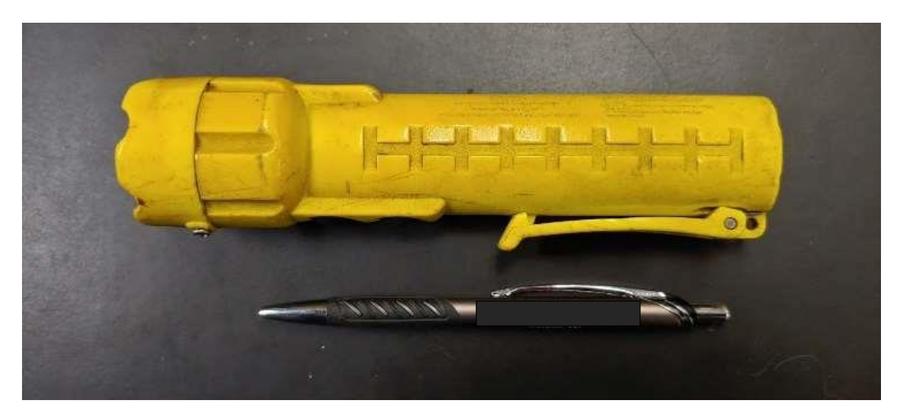
FLASHLIGHT: Practical size that fits in your pocket and bright/beamed enough to illuminate bilge recesses. Should be OSHA Approved and Explosion Proof.