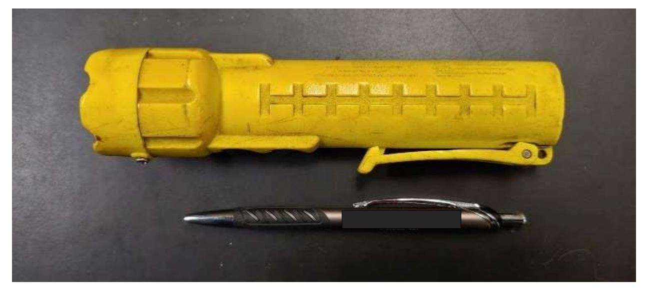
FLASHLIGHT: Practical size that fits in your pocket and bright/beamed enough to illuminate bilge recesses. Should be OSHA Approved and Explosion Proof.