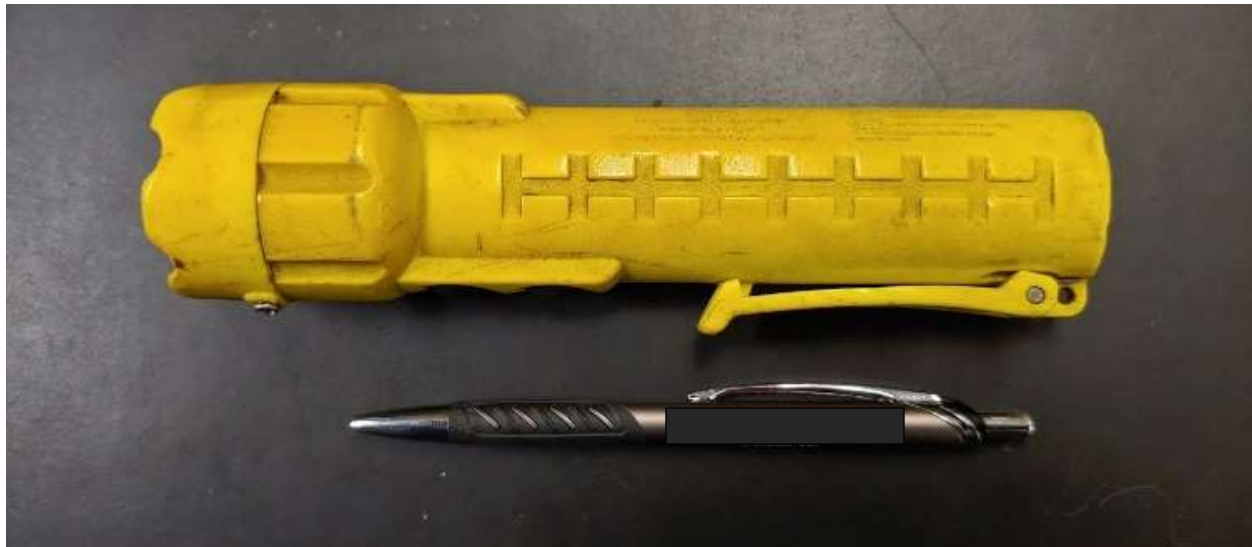
FLASHLIGHT: Practical size that fits in your pocket and bright/beamed enough to illuminate bilge recesses. Should be OSHA Approved and Explosion Proof.