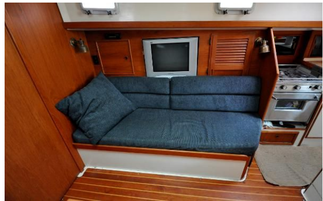
Nonsuch 36 - nee Duette - Salon