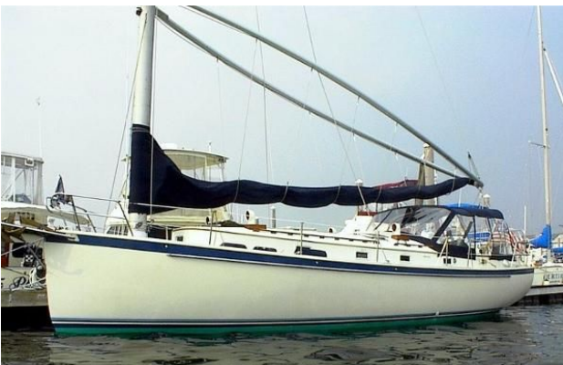
Nonsuch 36 - nee Duette - ex Owners Pictures Prior to New Paint