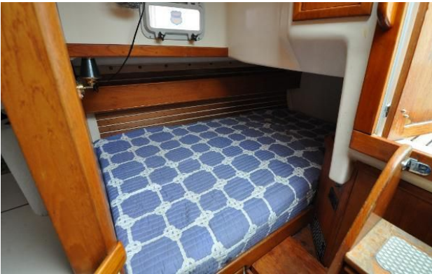
Nonsuch 36 - nee Duette - Quarter Berth