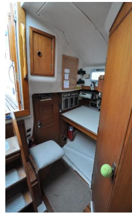
Nonsuch 36 - nee Duette - Navigation Station