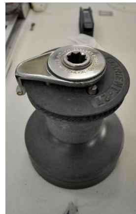
Nonsuch 36 - nee Duette - Secondary Winch