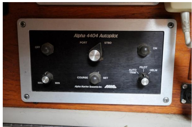
Nonsuch 36 - nee Duette - Autopilot Controller