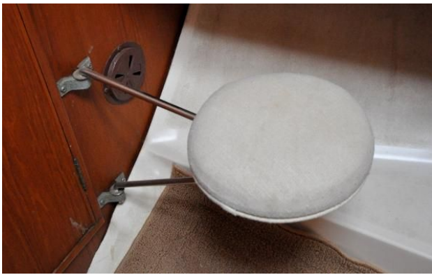
Nonsuch 36 - nee Duette - Master Cabin Vanity Swing Seat