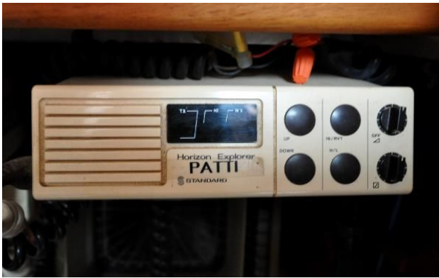
Nonsuch 36 - nee Duette - Marine VHF