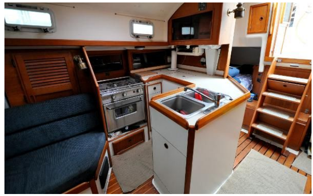
Nonsuch 36 - nee Duette - Galley