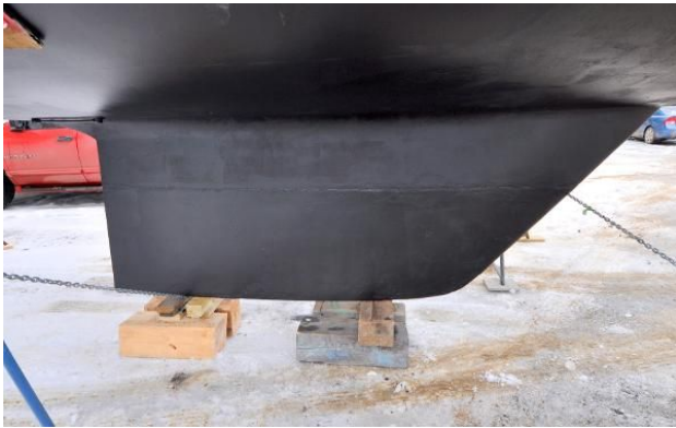
Nonsuch 36 - nee Duette - On Hard 2020