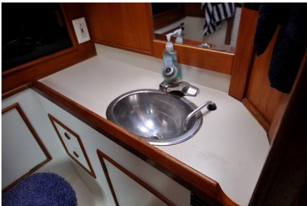
Nonsuch 36 - nee Duette - Head Sink