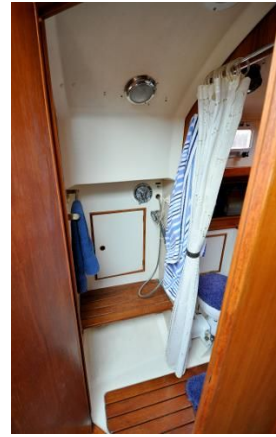
Nonsuch 36 - nee Duette - Shower Stall