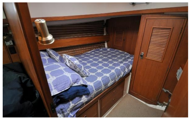
Nonsuch 36 - nee Duette - Master Cabin