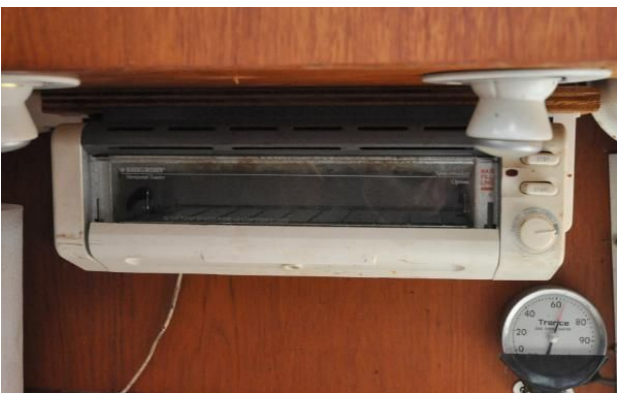
Nonsuch 36 - nee Duette - Galley Toaster