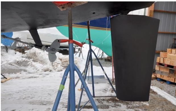
Nonsuch 36 - nee Duette - On Hard 2020