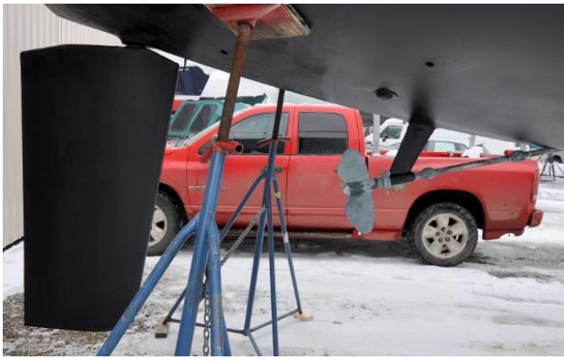
Nonsuch 36 - nee Duette - On Hard 2020