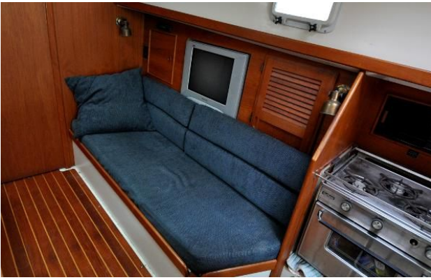
Nonsuch 36 - nee Duette - Salon