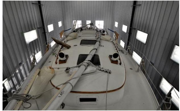
Nonsuch 36 - nee Duette - Deck