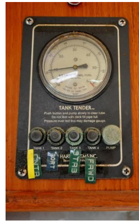
Nonsuch 36 - nee Duette - Galley Tank Tender