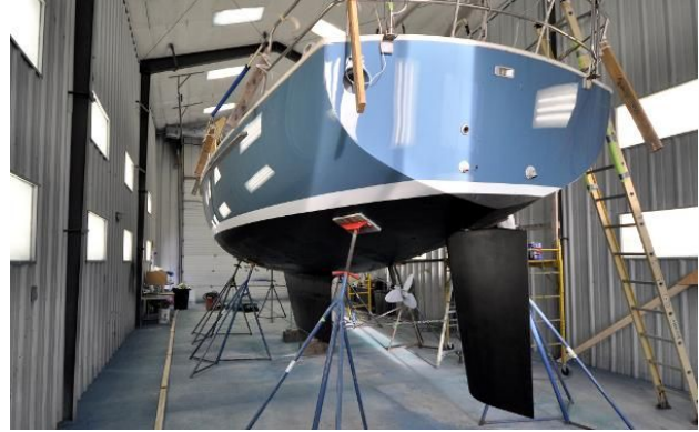
Nonsuch 36 - nee Duette - Paint Bay 2020