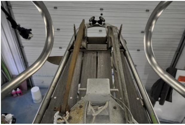
Nonsuch 36 - nee Duette - Bow Sprit and Anchors