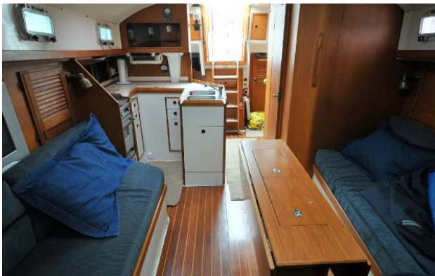
Nonsuch 36 - nee Duette - Salon