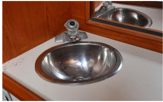
Nonsuch 36 - nee Duette - Master Cabin Sink