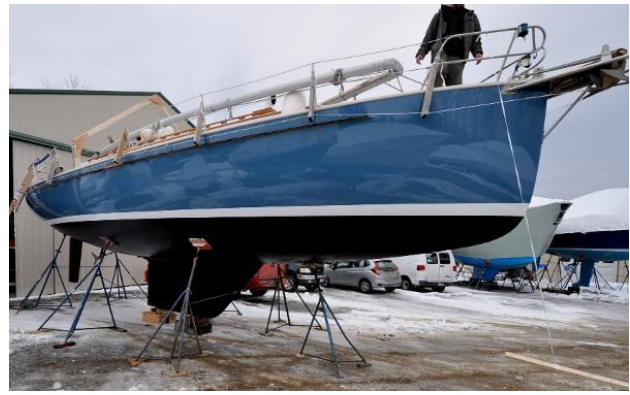
Nonsuch 36 - nee Duette - On Hard 2020