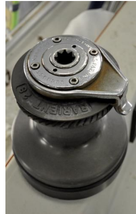
Nonsuch 36 - nee Duette - Primary Winch