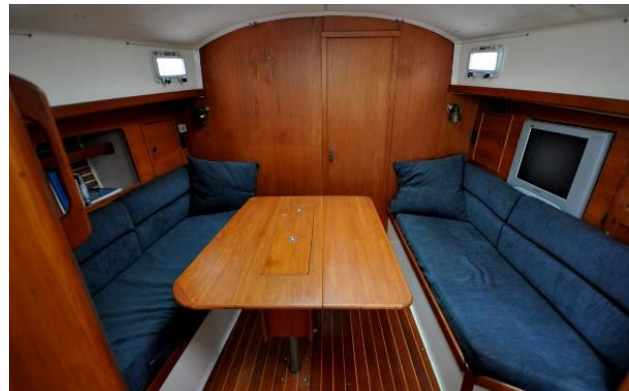
Nonsuch 36 - nee Duette - Salon