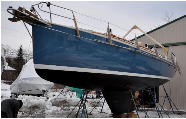
Nonsuch 36 - nee Duette - On Hard 2020