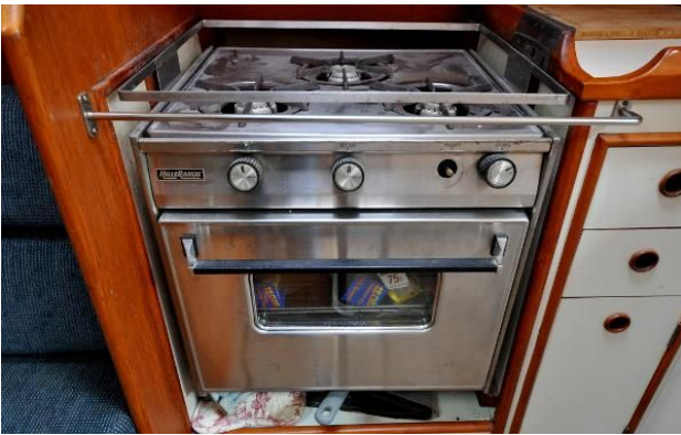
Nonsuch 36 - nee Duette - Galley Stove