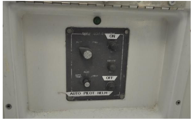
Nonsuch 36 - nee Duette - Autopilot