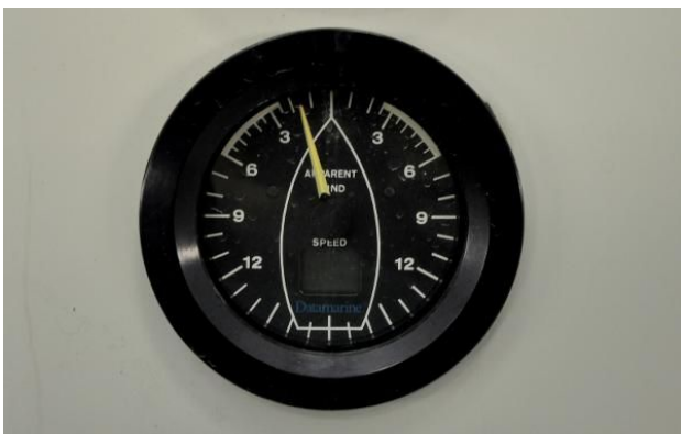
Nonsuch 36 - nee Duette - Electronics Display Cockpit