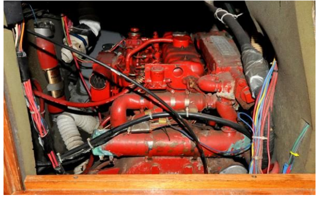
Nonsuch 36 - nee Duette - Engine