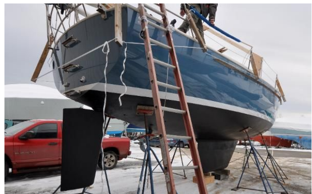
Nonsuch 36 - nee Duette - On Hard 2020