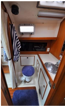
Nonsuch 36 - nee Duette - Head