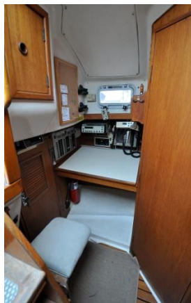
Nonsuch 36 - nee Duette - Navigation Station