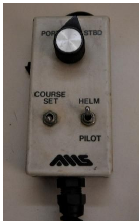
Nonsuch 36 - nee Duette - Autopilot Remote