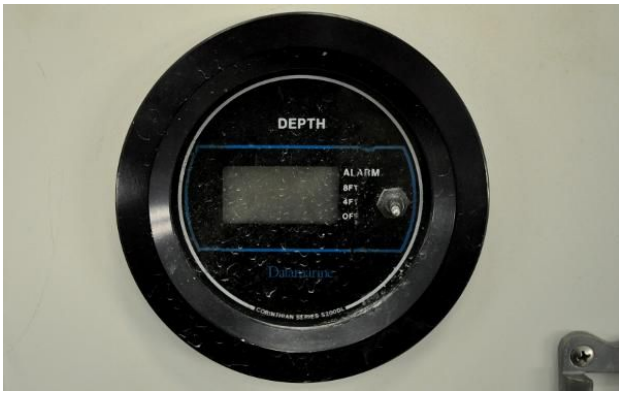
Nonsuch 36 - nee Duette - Electronics Display Cockpit