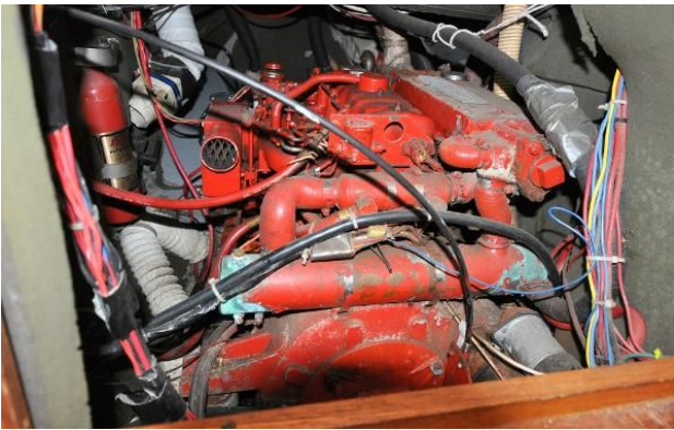
Nonsuch 36 - nee Duette - Engine