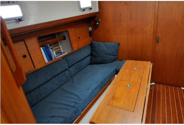
Nonsuch 36 - nee Duette - Salon