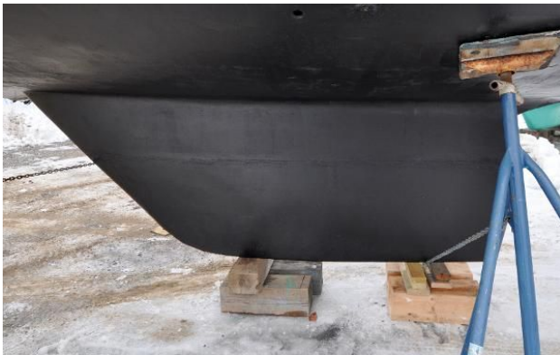
Nonsuch 36 - nee Duette - On Hard 2020