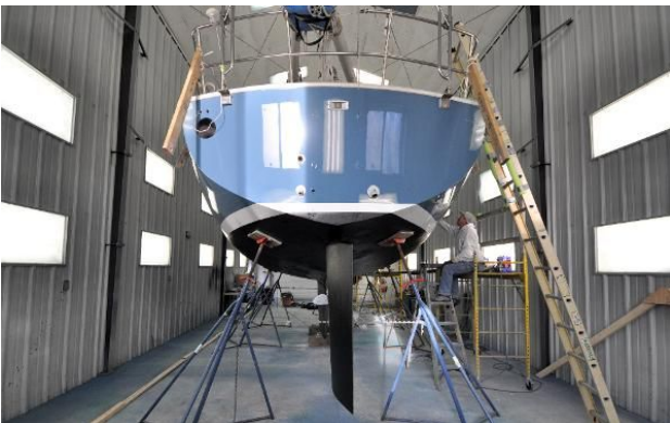
Nonsuch 36 - nee Duette - Paint Bay 2020