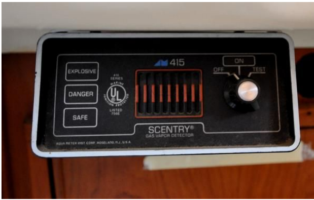
Nonsuch 36 - nee Duette - Gas Detector