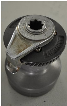
Nonsuch 36 - nee Duette - Secondary Winch