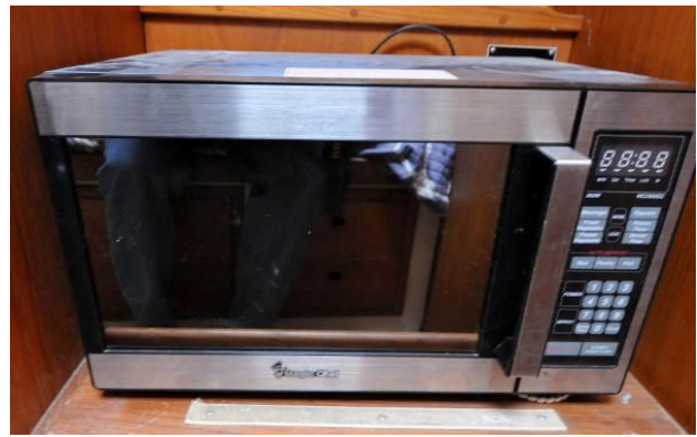
Nonsuch 36 - nee Duette - Master Cabin Microwave