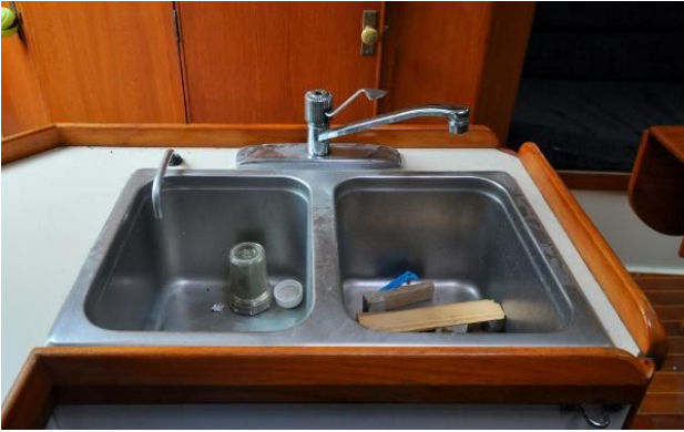
Nonsuch 36 - nee Duette - Galley Sink