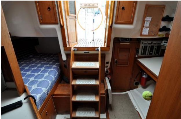
Nonsuch 36 - nee Duette - Quarter Berth