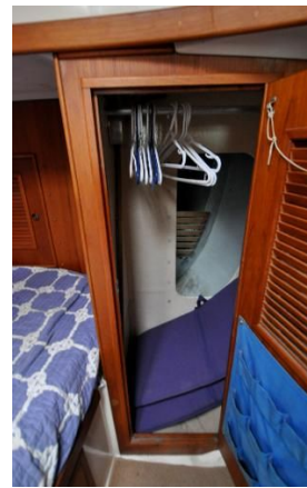
Nonsuch 36 - nee Duette - Master Cabin