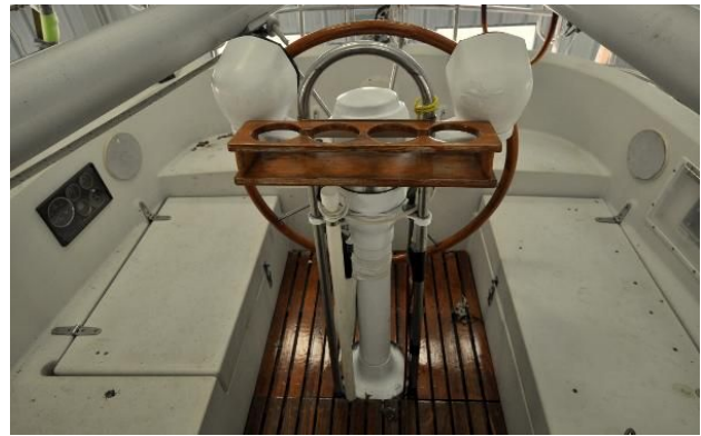
Nonsuch 36 - nee Duette - Cockpit