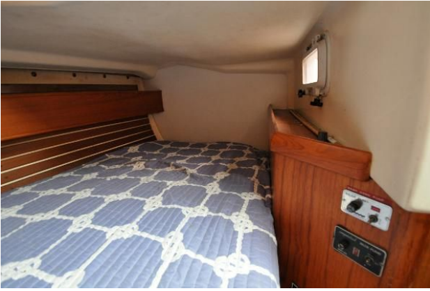
Nonsuch 36 - nee Duette - Quarter Berth