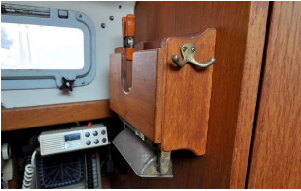
Nonsuch 36 - nee Duette - Navigation Station