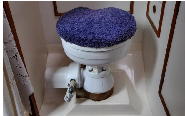
Nonsuch 36 - nee Duette - Head