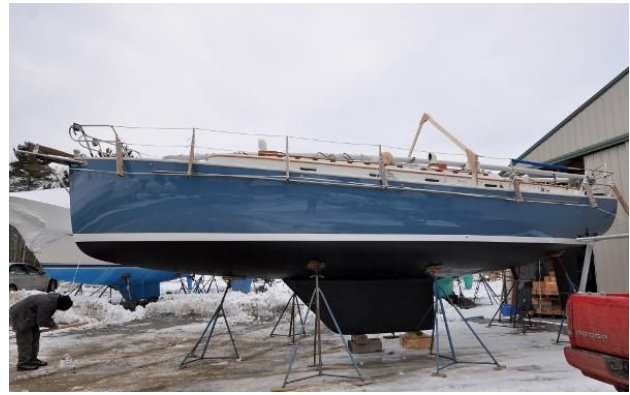
Nonsuch 36 - nee Duette - On Hard 2020