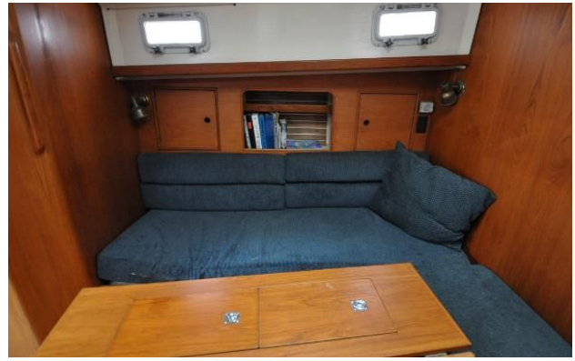
Nonsuch 36 - nee Duette - Salon