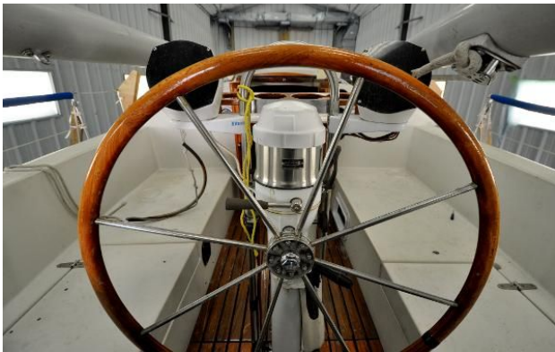
Nonsuch 36 - nee Duette - Cockpit