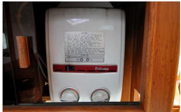
Nonsuch 36 - nee Duette - Galley Hot Water Heater