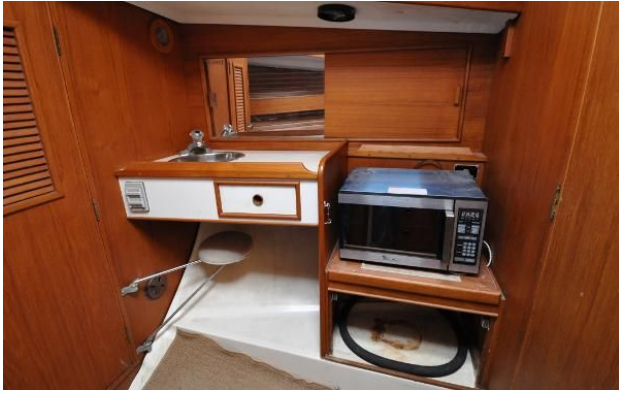
Nonsuch 36 - nee Duette - Master Cabin