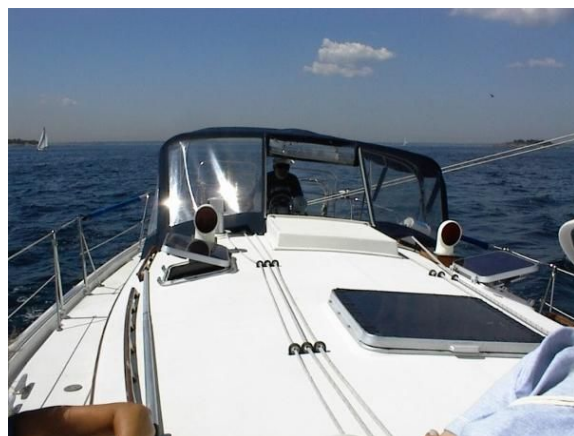
Nonsuch 36 - nee Duette - ex Owners Pictures