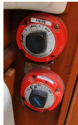
Nonsuch 36 - nee Duette - Battery Switches