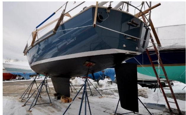
Nonsuch 36 - nee Duette - On Hard 2020