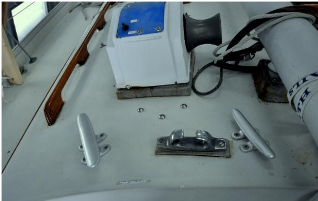
Nonsuch 36 - nee Duette - Electric Winch on Coach Roof