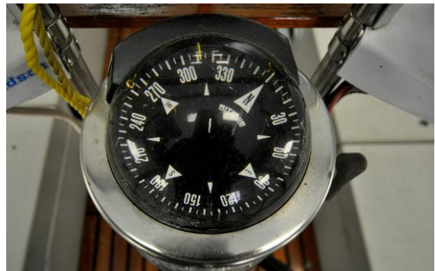
Nonsuch 36 - nee Duette - Ships Compass