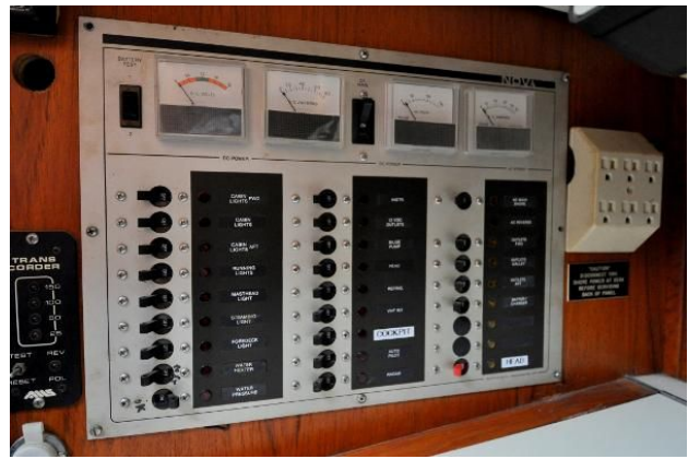
Nonsuch 36 - nee Duette - Electric Panel