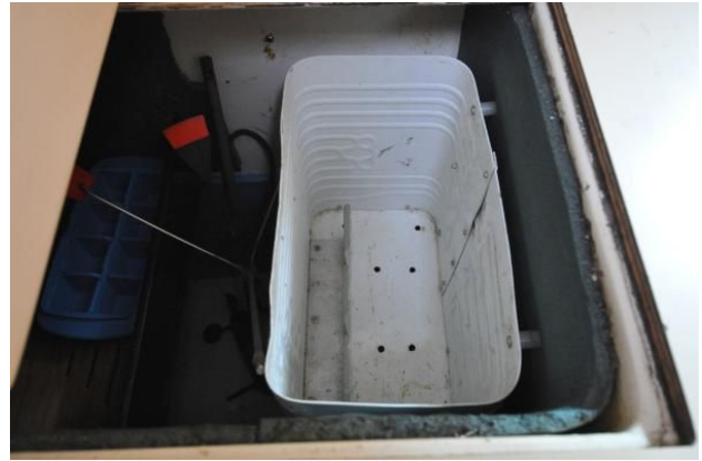
Nonsuch 36 - nee Duette - Refrigeration