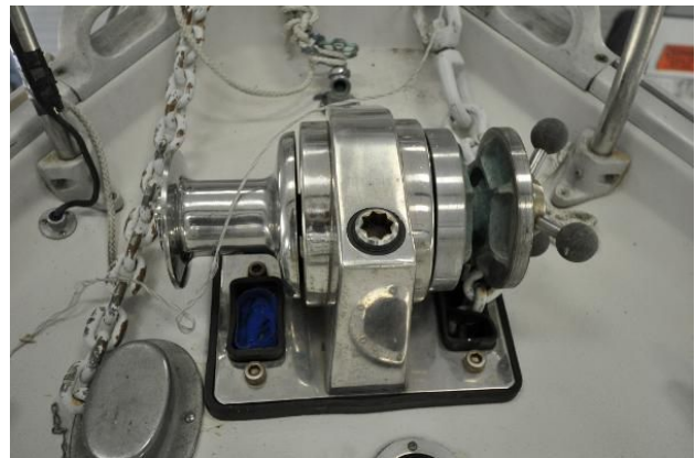
Nonsuch 36 - nee Duette - Windlass