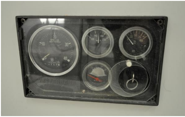
Nonsuch 36 - nee Duette - Engine Panel