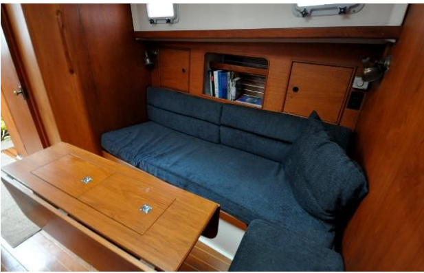
Nonsuch 36 - nee Duette - Salon