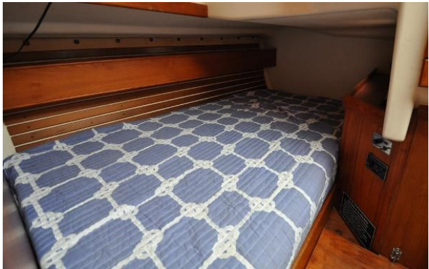
Nonsuch 36 - nee Duette - Quarter Berth