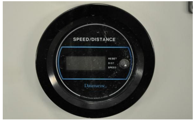
Nonsuch 36 - nee Duette - Electronics Display Cockpit