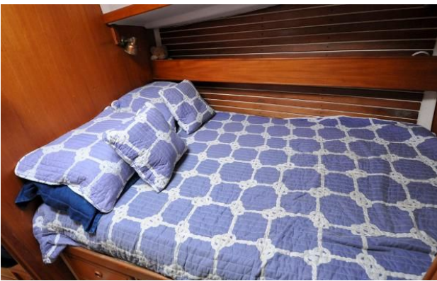
Nonsuch 36 - nee Duette - Master Cabin