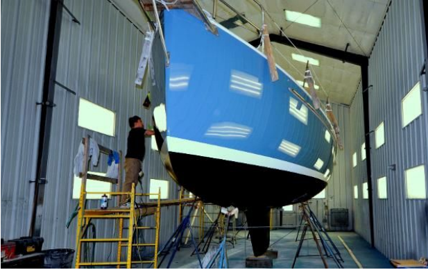
Nonsuch 36 - nee Duette - Paint Bay 2020