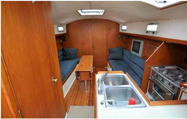
Nonsuch 36 - nee Duette - Salon