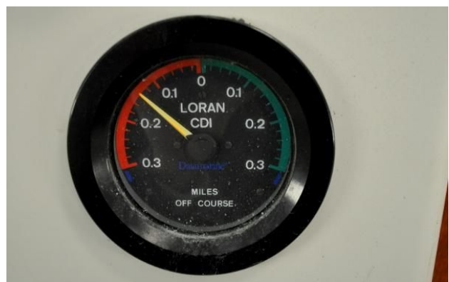
Nonsuch 36 - nee Duette - Electronics Display Cockpit