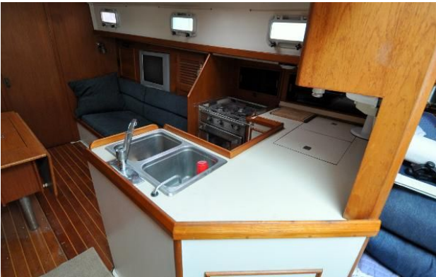
Nonsuch 36 - nee Duette - Galley