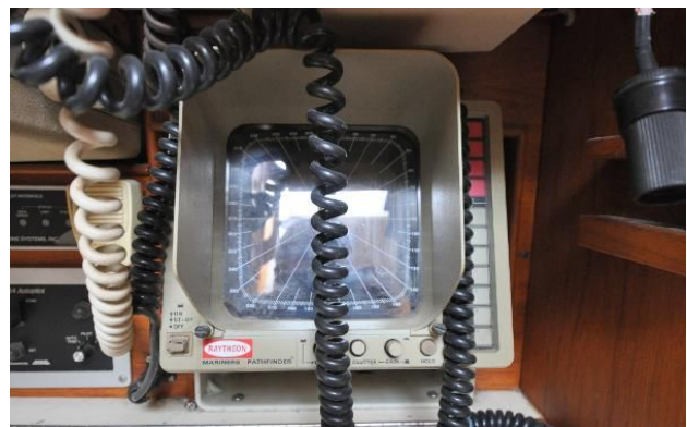
Nonsuch 36 - nee Duette - Radar Display