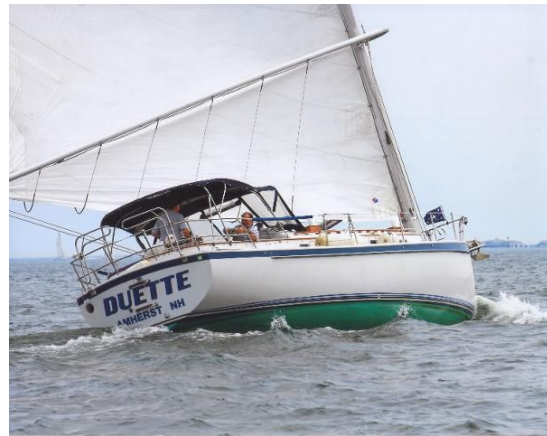
Nonsuch 36 - nee Duette - ex Owners Pictures Prior to New Paint