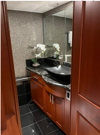
Master Stateroom Head (His)