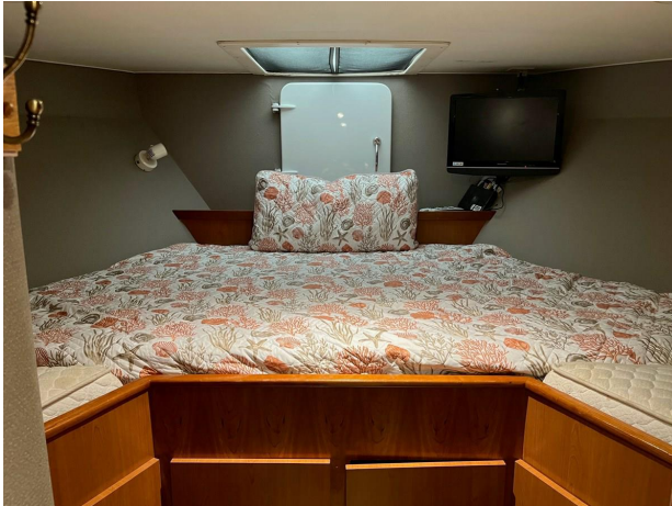
Crew Quarters - Bow