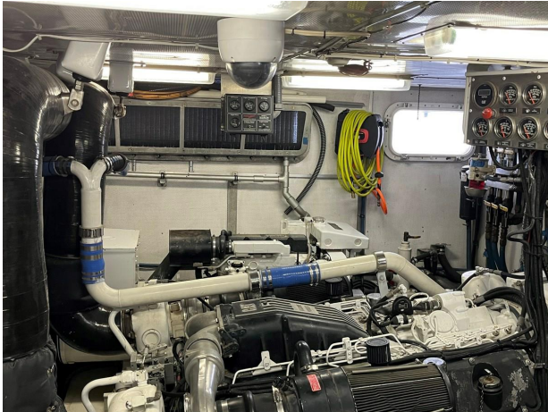
Engine Room -Portside