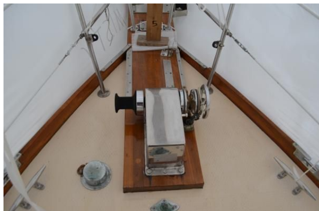
Ideal 12V Windlass