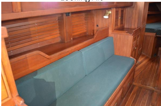
Port Salon & Pilot Berth