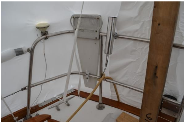
Edson Aluminum OB Bracket