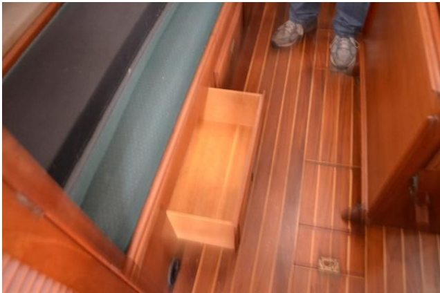
Drawers Under Settees