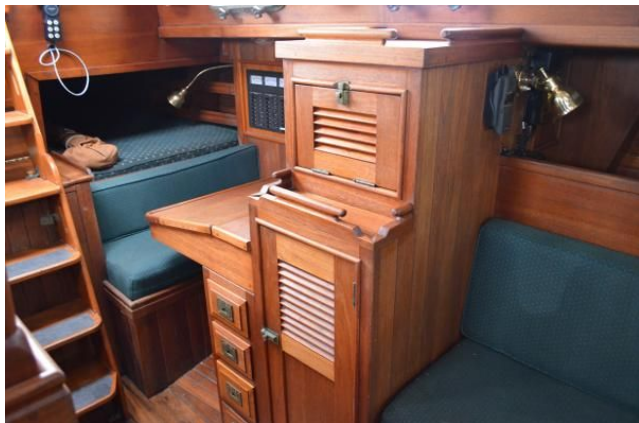
Wet Locker & Storage