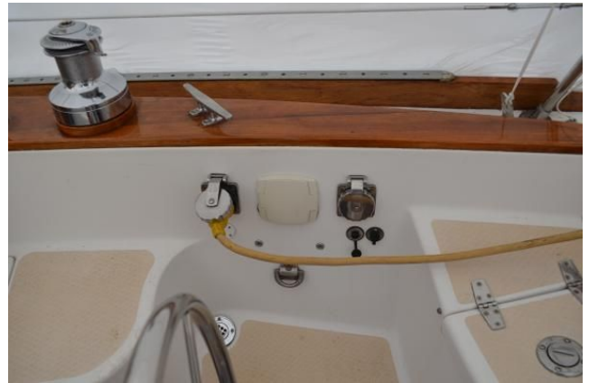
30 Amp Shore Service