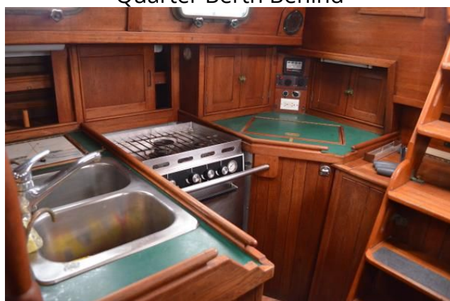
U-Shaped Galley With Seafrust Refrigerator