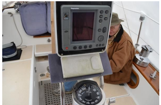
Raymarine RL70C Radar-GPS & Autopilot