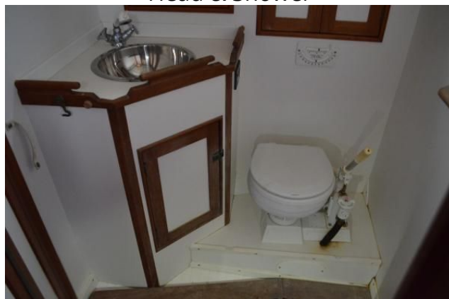
Head & Sink & Shower