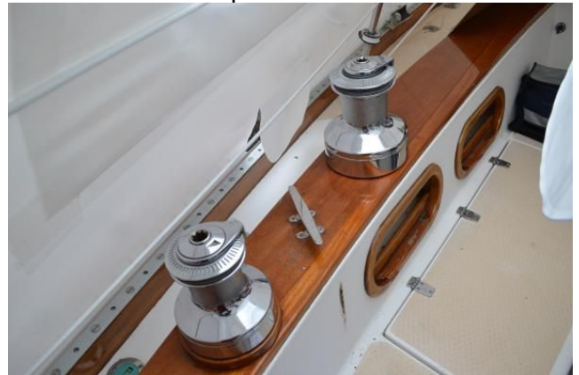
S.T. Sheet Winches