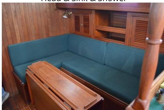
L-Settee Converts To A Double