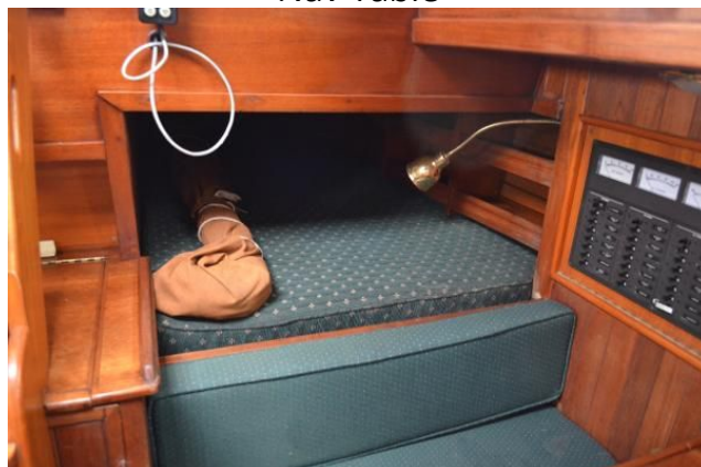
Quarter Berth Behind