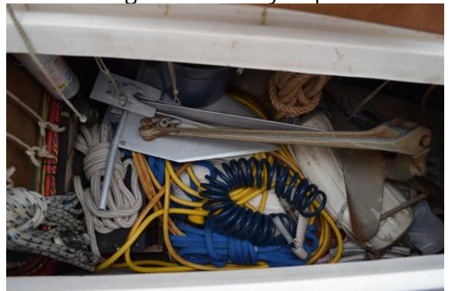
Starboard Sail Locker