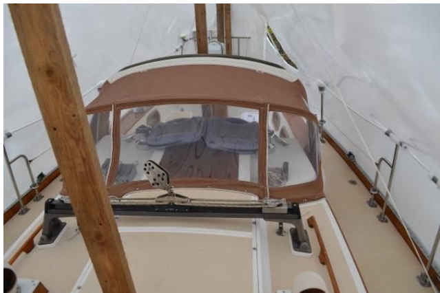
Dodger In Good Condition