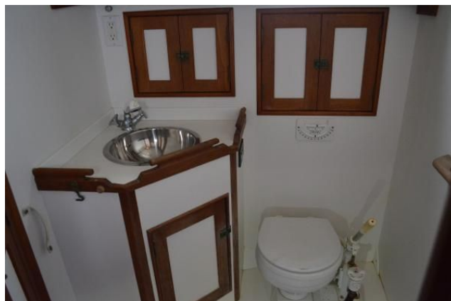
Head & Shower