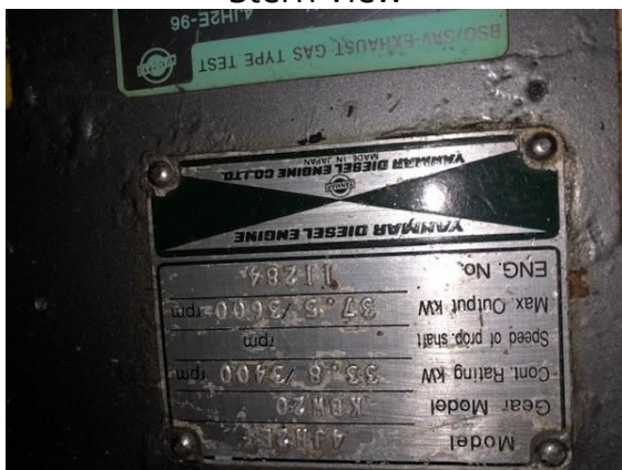
Engine Serial # On Yanmar 50 HP Diesel