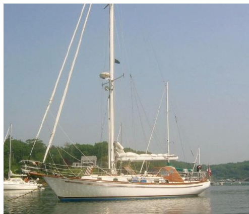
On Her Mooring