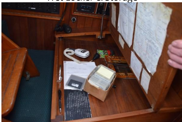
Lift Up Chart Table