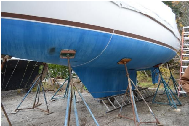
Very Smooth Underbody