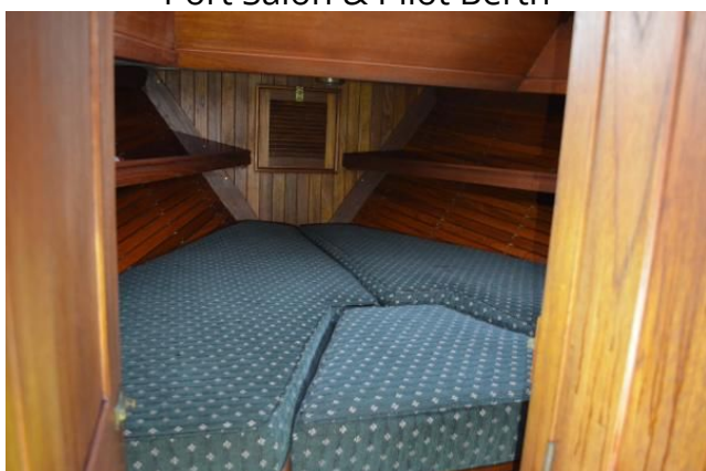
Spacious Vee Berths With Shelves