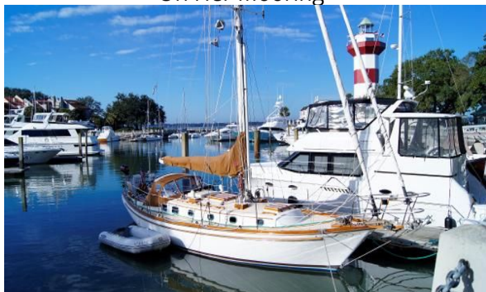
At The Dock