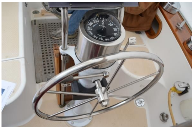
Edson Wheel Steering