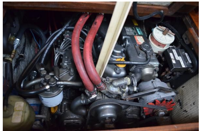
Rebuilt Engine in 2006 By Depaul Diesel