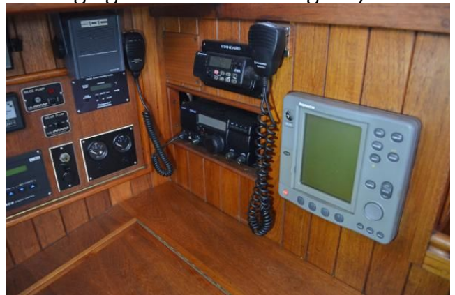
2nd Radar, SSB Radio