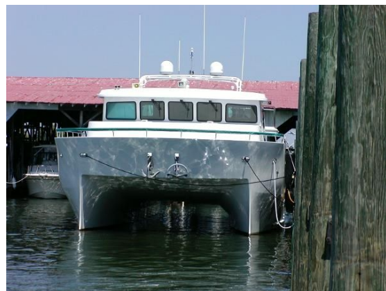
Bow View Dockside