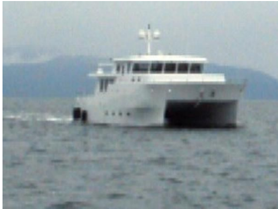
Sea Trials Bow Quarter View