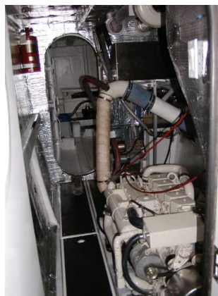
Starboard Engine Room