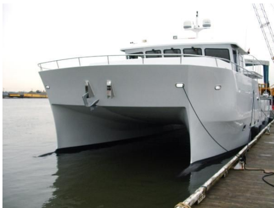
Bow Quarter View Dockside