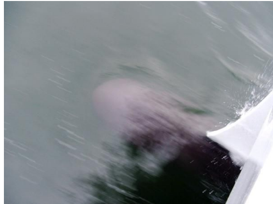
Sea Trials Bow Bulb