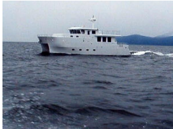
Sea Trials Abeam View