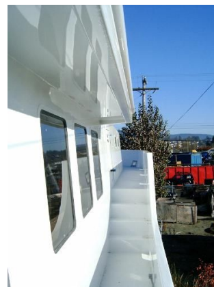
Side Deck Looking Forward