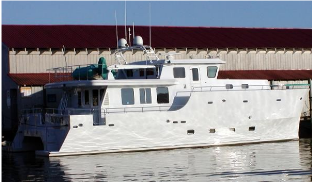
Seascope 55' Trawler Catamaran