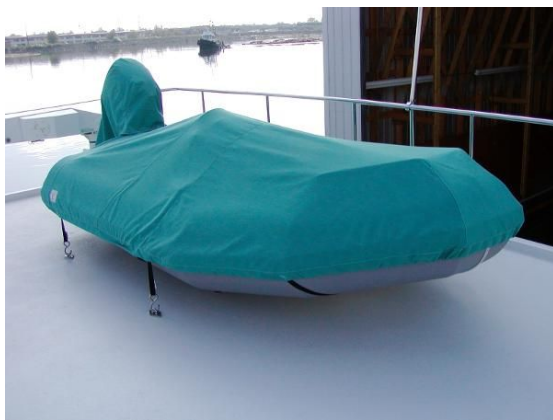
Tender (excluded but may be available separately)