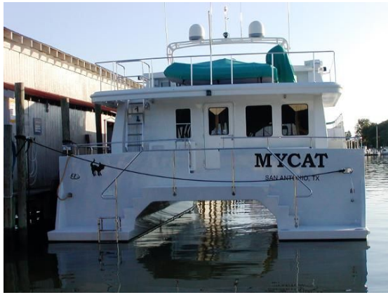
Stern View Dockside