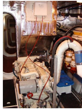
Port Engine Room