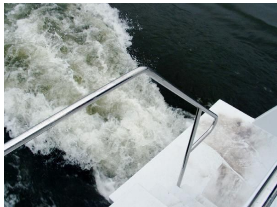
Sea Trials Stern