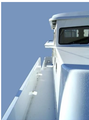
Side Deck Looking Aft