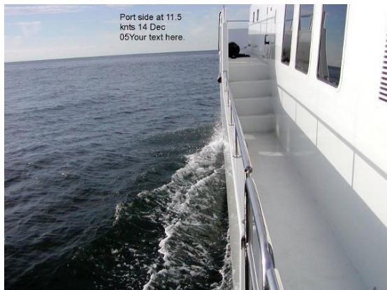
Sea Trials Port Side 11.5 knots