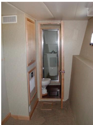
Stateroom to Head