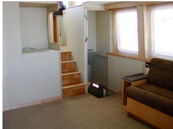
Salon to Pilothouse Steps