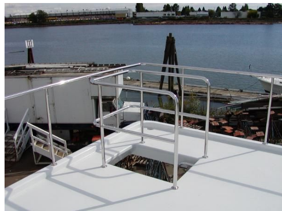
Boat Deck Access