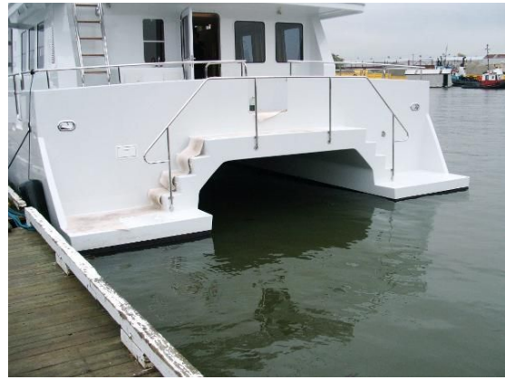
Aft Quarter View Dockside