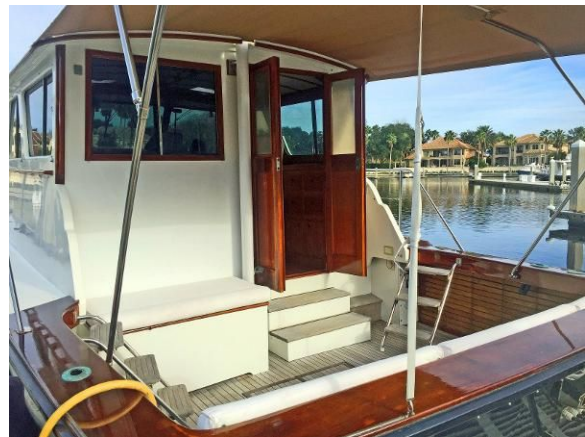
Cockpit, Looking Fwd.