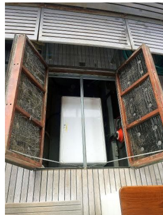
Generator in Sound Shield