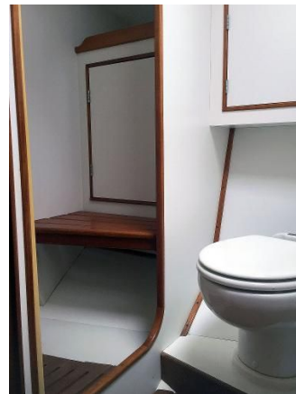
Fwd. Head and Shower