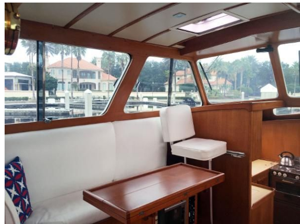
Pilothouse Settee, Looking Fwd.