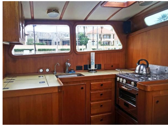
Galley, Opposite Salon