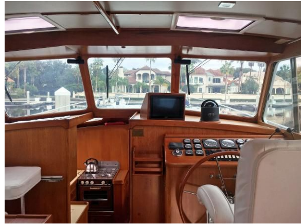
Pilothouse, Looking Fwd.