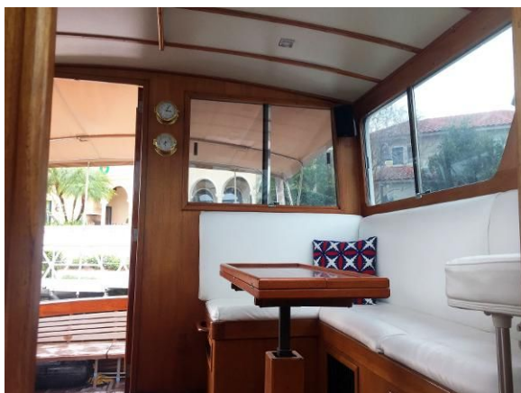
Pilothouse Settee, Looking Aft