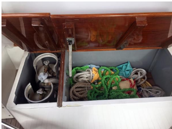
Cockpit Gas and Storage Locker