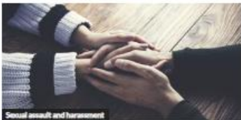
Sexual assault and harassment Deciding what to do after a sexual assault is deeply personal—here...