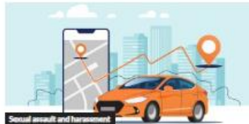
Sexual assault and harassment Taking an Uber or Lyft? Here are our top safety tips