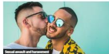
Sexual assault and harassment How to communicate your desires in hookups, relationships, and everything in...