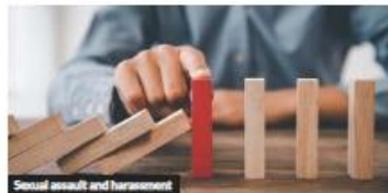
Sexual assault and harassment What does it mean to be an upstander? 4 ways to...