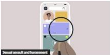
Sexual assault and harassment What to do if you (or a friend) is being stalked

Sexual assault and harassment Sexual health