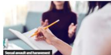
Sexual assault and harassment Why trauma-informed care is important for survivors of sexual trauma