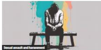
Sexual assault and harassment 4 ways to support a male friend who's been sexually assaulted