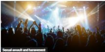
Sexual assault and harassment Your top safety tips for attending live music events