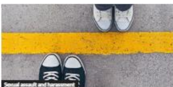
Sexual assault and harassment 4 ways to set healthy boundaries in relationships and everyday life